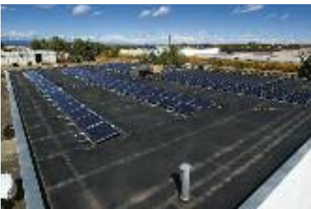
IBEW Local 68 members working with Empire Electric installed solar photovoltaic system at Source Communications facility in Colorado.

The system is rated at 22.4 KW and will supply up to 50 percent of power needs for the Source Communications facility. Design and installation were by Empire Electric of Broomfield, and utilized Local 68 electricians and apprentices for the project. The solar