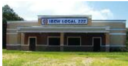
Local 222's new building is designed as a state-of-the-art facility.