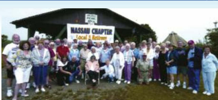
Local 3, Nassau Chapter, Retirees Club members attend annual retirees picnic.