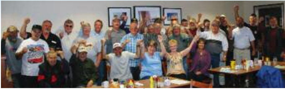
Retired IBEW members held an organizational meeting on Oct. 22 at Denny's Restaurant in Sparks, NV. About three dozen people showed up, ready to defend their medical benefits.