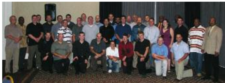
Local 76 congratulates the class of 2009 JATC apprentice graduates.