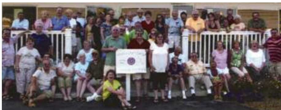
Local 3, North New Jersey Chapter, retirees attend a barbecue at the Local 3 Educational Center in Cutchogue, Long Island, NY.

Thirty members, spouses and guests attended a trip to Atlantic City. Everyone had a nice time, especially the winners.