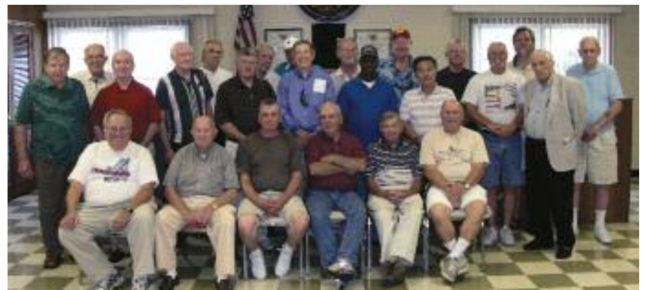
Attendees gather for a group photo at the IBEW Local 400 Retirees Club's combined meeting with the New Jersey Retirees Advisory Council