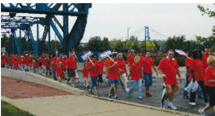
Toledo, OH, Local 8 members and families join 2009 Labor Day marchers.

Weigh in for the Annual Perch Tournament in September resulted in