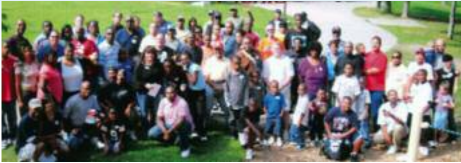
Cleveland, OH, Local 38 officers, members and their families attend picnic at Euclid Creek Metro Park.