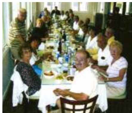
Local 3, Westchester/Putnam Chapter, retirees enjoy an August barbecue at Local 3's new Educational Center in Cutchogue on the north shore of Long Island, NY.