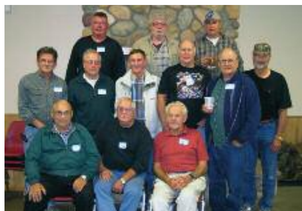
At Local 388's annual picnic, some of the retirees in attendance gather for a photo.