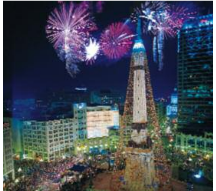
The "world's tallest Christmas tree" in Indianapolis is the centerpiece of the city's holiday celebration.

The tree lighting, each Thanksgiving weekend, is the biggest seasonal event in Indianapolis. It attracts more than 100,000 holiday revelers, with hundreds of thousands more watching on TV. ■